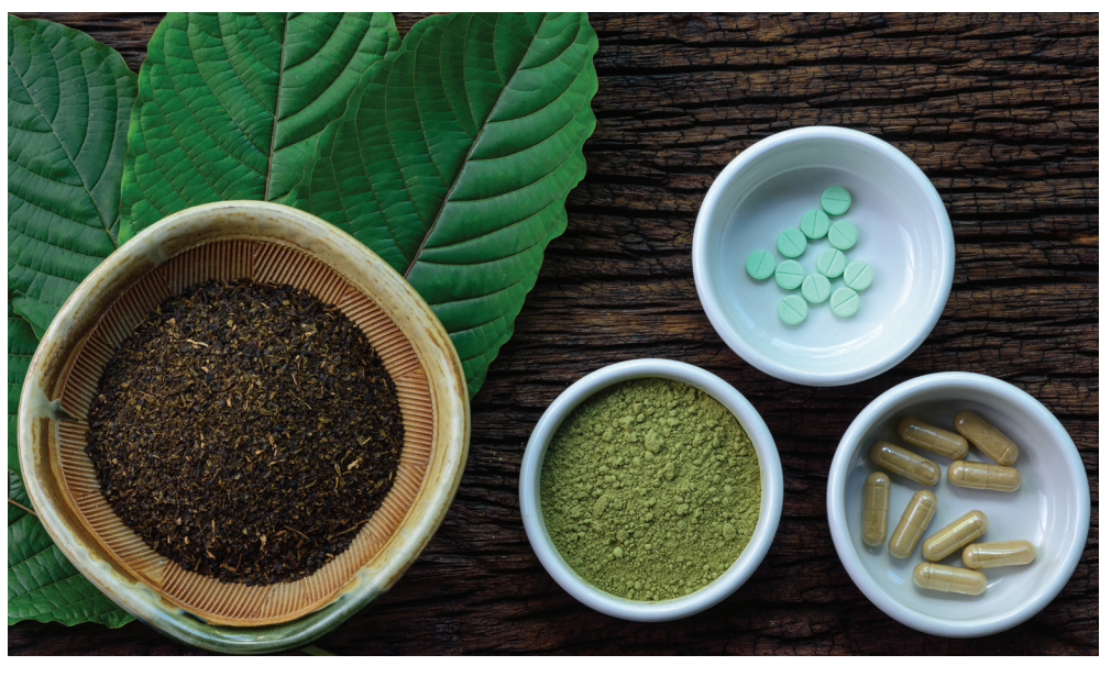
Dried kratom leaves can be brewed in tea, powdered and added to drinks, or consumed as a capsule, pill, or extract.

People are experimenting with kratom for relaxation and as an alternative treatment for pain, mood disorders, and opioid withdrawal — all without supervision from doctors. Because kratom can cause physical dependence and isn't regulated, any use comes with real risks.